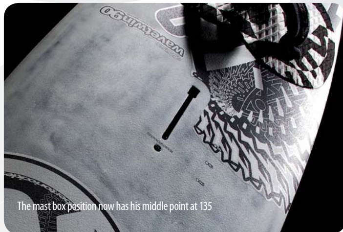
The mast box position now has his middle point at 135