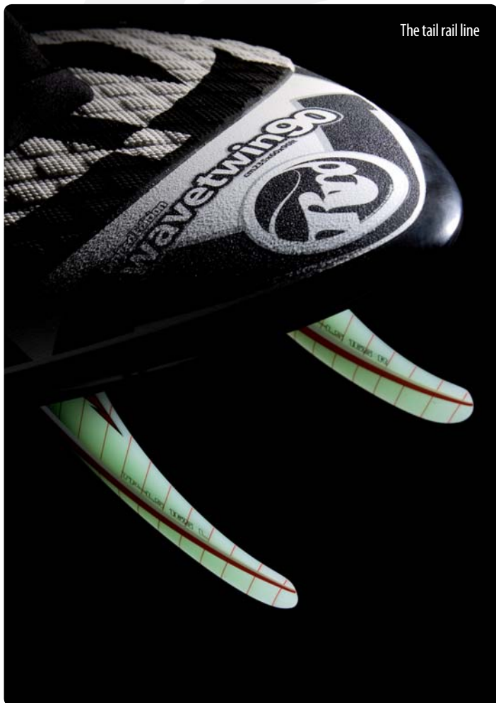
The tail rail line