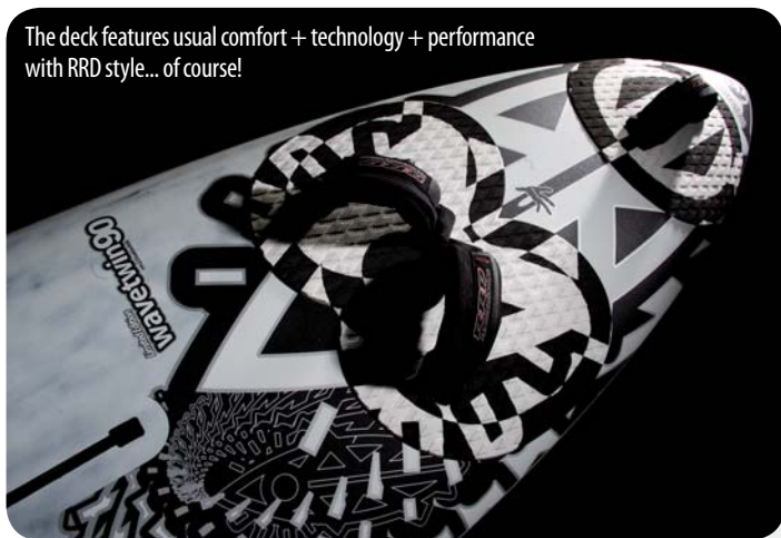
The deck features usual comfort + technology + performance with RRD style... of course!