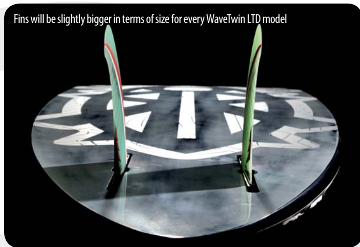
Fins will be slightly bigger in terms of size for every WaveTwin LTD model