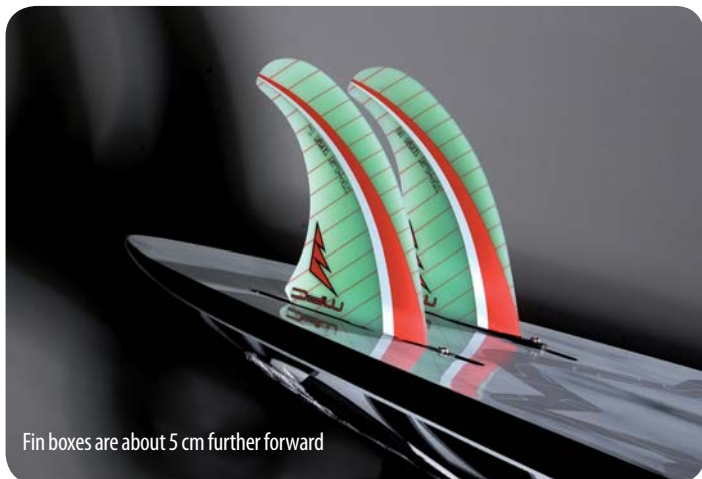
Fin boxes are about 5 cm further forward